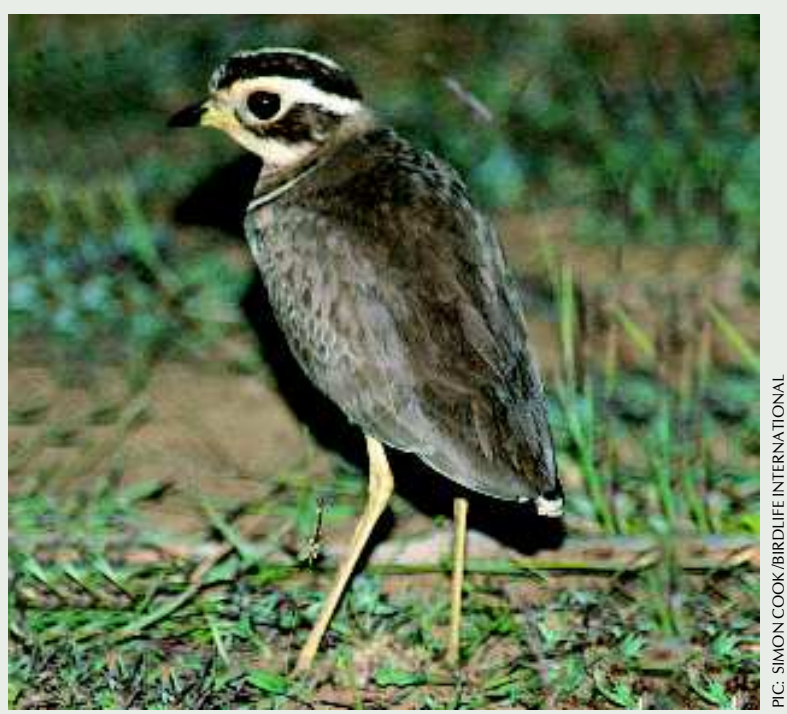
Radio tagging will help to unravel the secret life of the critically endangered Jerdon's Courser

For the bird which is nocturnal, rare and difficult to find, radio-telemetry would be the best way to study and in turn to conserve it. This proposal was put forward by BNHS and