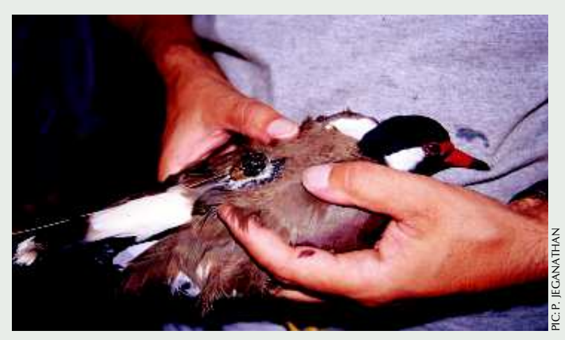
A Red-wattled Lapwing with radio tag on its back.

Jerdon's Courser roost during the day, for which they could be using different habitats within the scrub forest than that used for feeding. It is very difficult to locate the Jerdon's Courser during the day. More importantly, nothing is known of the habitat used for breeding by Jerdon's Courser because so far no nests have ever been found. Radio-tracking would facilitate to begin investigations into their roosting and breeding habitat requirements. Apart from that, it is possible to estimate the number of individuals present in an area by measuring the ratio of untagged to tagged individuals responding to tape playback. Since the number of tagged individuals is known, the total number of individuals present could be obtained using this ratio. It would also be possible